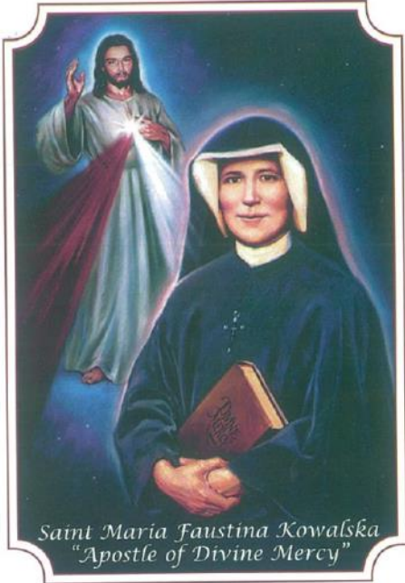
Saint Maria Faustina Kowalska "Apostle of Divine Mercy"

Taken from her Diary 'Divine Mercy in My Soul' (Diary reference 1209 to 1229)